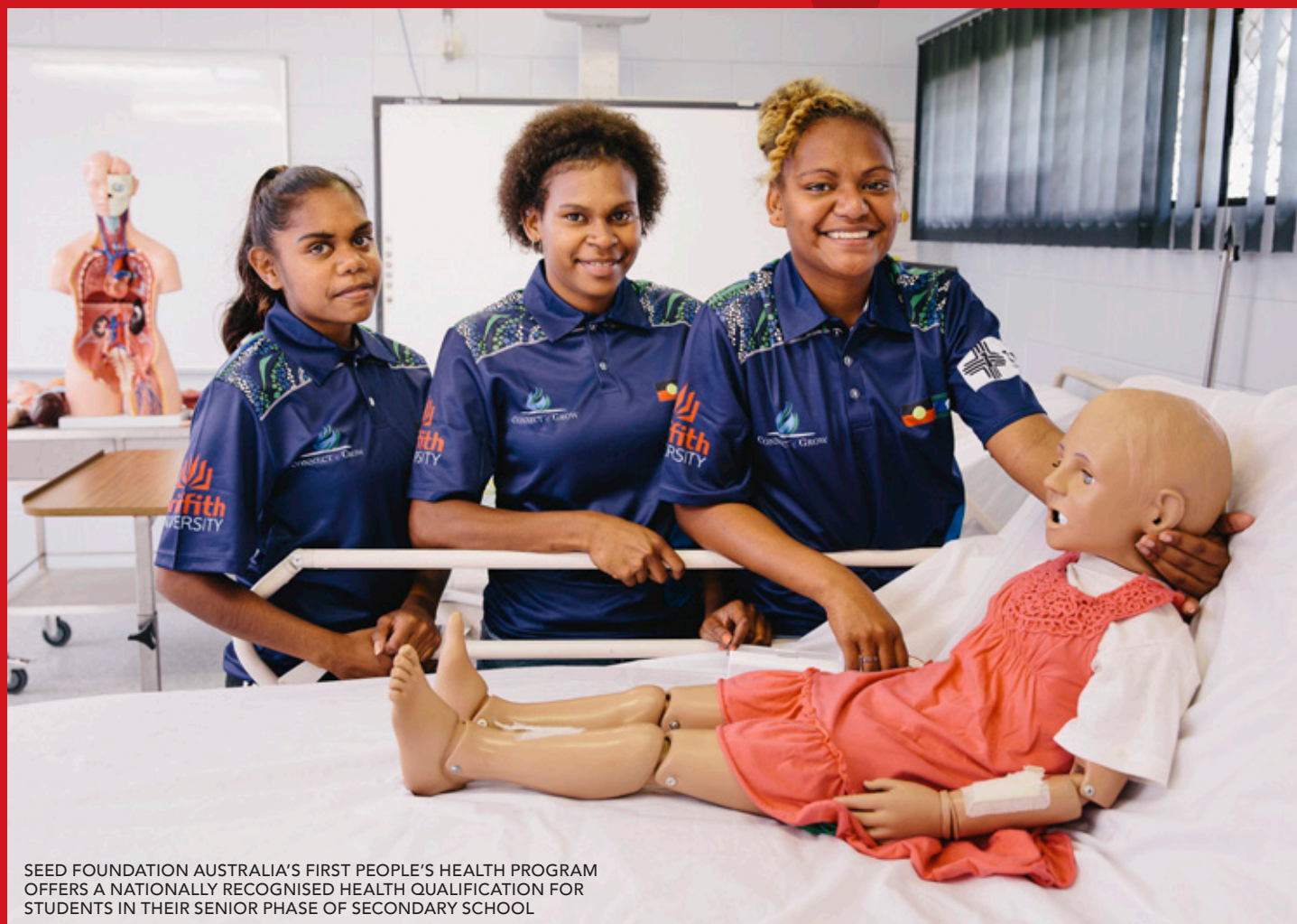
SEED FOUNDATION AUSTRALIA'S FIRST PEOPLE'S HEALTH PROGRAM OFFERS A NATIONALLY RECOGNISED HEALTH QUALIFICATION FOR STUDENTS IN THEIR SENIOR PHASE OF SECONDARY SCHOOL