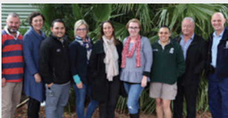
CAPP WORKING GROUP 2017